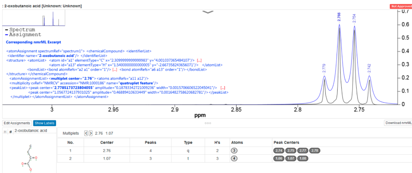
Figure 2. Assignment of an identified molecule in a single compound spectrum, generated in nmrML-Assign and displayed using the JSpectraViewer (JSV). An uploaded raw FID for the 2-oxobutanoic acid reference compound was automatically processed with Bayesil. The resulting interactive JSV spectrum then allows the assignment of peaks to specific atoms, using the nmrML-Assign tool. The assignment metadata is then saved in the nmrML format (see https://github.com/nmrML/nmrML/tree/master/examples/reference_spectra_examples/hmdb ). An excerpt view of the corresponding nmrML code (blue code inset) is shown for the quadruplet assignment (Multiplet no. 1) of the second peak (bold code). The corresponding HMDB entry is available from http://www.hmdb.ca/metabolites/HMDB00005 , with the ^1\text{H} spectrum found at http://www.hmdb.ca/spectra/nmr_one_d/1024 .

nmrML version, the sources of the controlled vocabularies or ontologies used for metadata annotation, the data depositor contact, source files/formats, software lists, the instrument configuration, sample information (e.g., solvent and reference standards), acquisition settings, and data processing information. This is followed by the spectral FID raw data, as a base64-encoded binary. In addition to such a “minimal” nmrML data file, additional information such as molecule identification/spectral assignment metadata and quantification data can also be included. For example, if the NMR data is for a pure reference compound or a newly isolated/synthesized single chemical, the nmrML file can include data on the chemical structure and corresponding atom-specific peak feature assignments (see example generated by nmrML-Assign in Figure 2 or http://nmrml.org/examples/3 ). If the NMR data is for a complex mixture, consisting of many different compounds from an analytical setting, the nmrML file can include data on peak positions, integrated peak areas, and putative peak assignments, together with relative or absolute concentrations of some or all of the compounds but no annotation of individual peak features to atom environments (see http://nmrml.org/examples/4 ). Code examples of a minimal nmrML data XML file as well as for the expanded metadata case are provided on the examples page ( http://nmrml.org/examples ).